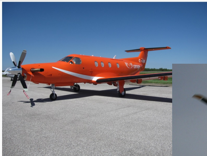
Piatus PC12 Fixed Wing Airplane